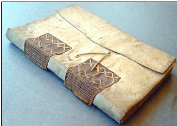
Top: Recycled parchment manuscript Bottom: Envelope flap

As mentioned earlier, limp vellum bindings were ideal blank books because their flat opening allowed an ease of writing. These books unfortunately were difficult to keep closed, so in addition to fasteners, ties of vellum, linen, silk, and alum tawed leather were frequently employed. A protruding flap at the fore-edge helps protect the textblock pages. Alongside fasteners and ties, the prevalence of fore-edge flaps demonstrates that these bindings contained important materials. A variance on the fore-edge flap is the envelope flap, an Islamic influenced element. Both the envelope flap and the square fore-edge flap are related to the more subtle bent edge or yapp.