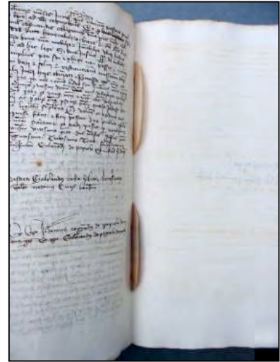
Parchment stays protect paper.

To hold turn-ins in place without adhesives, the vellum was frequently tacked at the fore-edge corner with either twine or thin alum tawed leather strips. Limp vellum bindings in this collection are frequently without turn-ins. The variety of fasteners and ties in the collection is fascinating. Of particular note are the toggle fasteners which are tightly rolled vellum or alum tawed leather that connect to a loop on the opposite cover. The loops are either twisted twine or vellum strips.