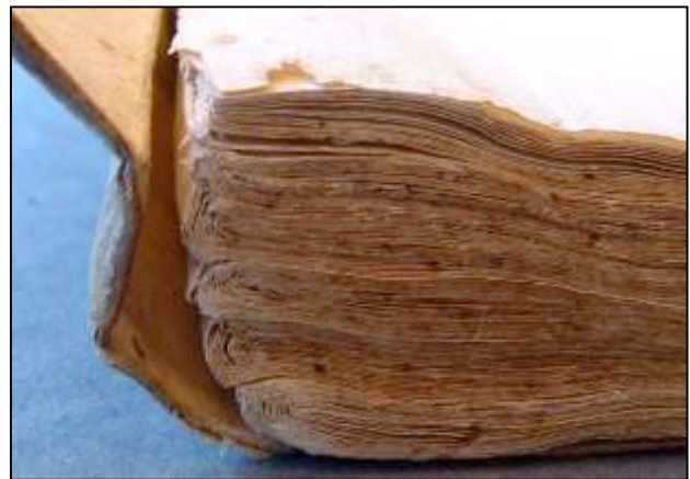
Thick sections that could quickly be sewn together.

Scholars date limp vellum bindings back to the 14 th century, and the earliest example in the archives at Vilassar dates to approximately 1340. Limp vellum bindings were used most popularly as account books from their inception until the mid 1600s when stiff or semi-stiff vellum bindings became popular as account books increased in size. Printed books also were often sold in limp vellum covers in the sixteenth and seventeenth century as an economical alternative to leather bindings. While this use of limp vellum on printed books decreased in popularity in the eighteenth century,