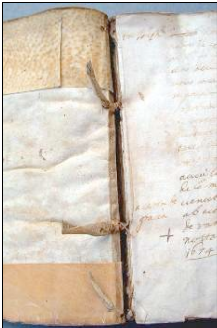
Laced-in sewing on single raised sewing supports

Like any book, limp vellum bindings have the basic structural elements of covering material, textblock, and textblock to cover attachment. Other exterior elements include rigid backplates, tacketing, protective