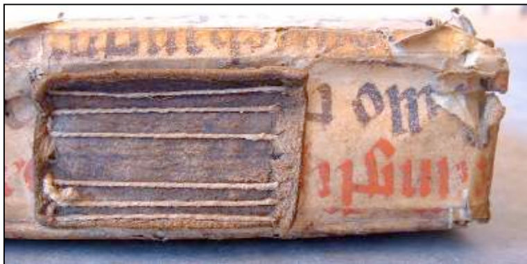
Leather backplate supports sewing.

Tacketing can also be ornamental. Decorative tacketing on limp vellum bindings involves the lacing of alum tawed leather or strips of vellum in patterns on the exterior cover. While the bindings in the