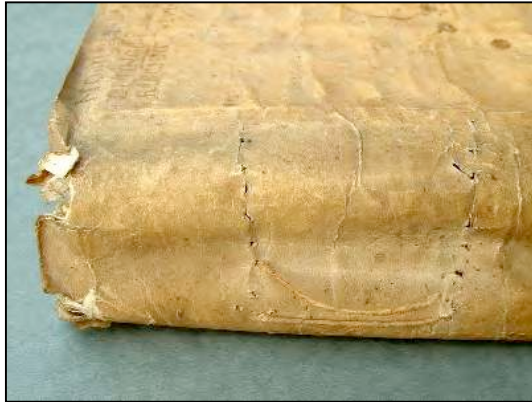
Broken sewing and torn vellum, typical of long stitch sewing without backplates.

Although quite simple and quick, the long stitch style of sewing is not without its problems. Thread or