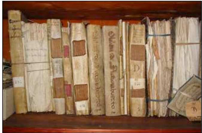
Several examples of archival long stitch sewing.

The second sewing structure is more predominant in the archive at Vilassar. Long stitch archival sewing is a very straightforward and fast style of sewing that creates a mechanical tightback attachment of the text to the covering material. The archival long stitch sewing structure has continuous sewing between the stations linking each section either independently or to one another as well as to the vellum cover.