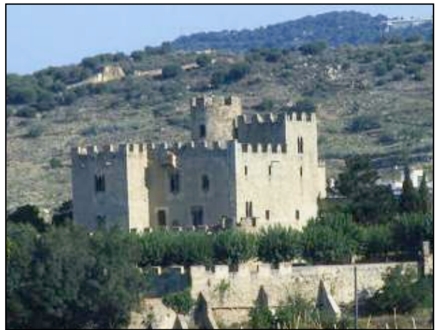
Castillo de Vilassar de Dalt.

The Castillo de Vilassar de Dalt occupies a strategic position in foothills above the village of the same name, overlooking the Mediterranean just twenty-six kilometers northeast of Barcelona, Spain. The central tower of this castle fortress was constructed in the 11 th century and served as a defensive structure guarding against invasion and pirates attacks. Over the course of the next few centuries, it evolved through form and function into a noble mansion, passing by inheritance through several aristocratic families. In the mid