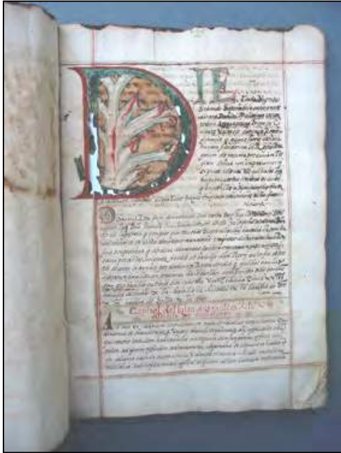
Degradation of the copper-based verdigris

environment, the condition of this media on archival materials is surprisingly good. In addition to iron gall ink, carbon black ink is another media found on paper and parchment materials. A potential project for future teams is an examination of the pigments used on the parchments and on paper in the limp vellum bindings. While the media in the limp vellum books have been protected from light and other deleterious effects, as you can see here from the degradation of the copper-based green verdigris in this fifteenth century binding, some pigments have inherent problems.