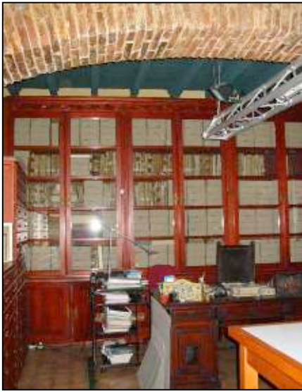
Castle archives, 2004

My former instructor, Karen, flew to Spain to re-assess the project. Earlier teams had successfully re-housed the bound volumes with bookshoes, phase boxes and drop spine boxes. Most of the flattened parchment documents had been tied between boards and placed in flat files built specifically for their storage. Most of the paper documents, however, were still tied in bundles or in the red metal boxes and there were nearly 1,500 stiffly folded parchments that were impossible to open or read.